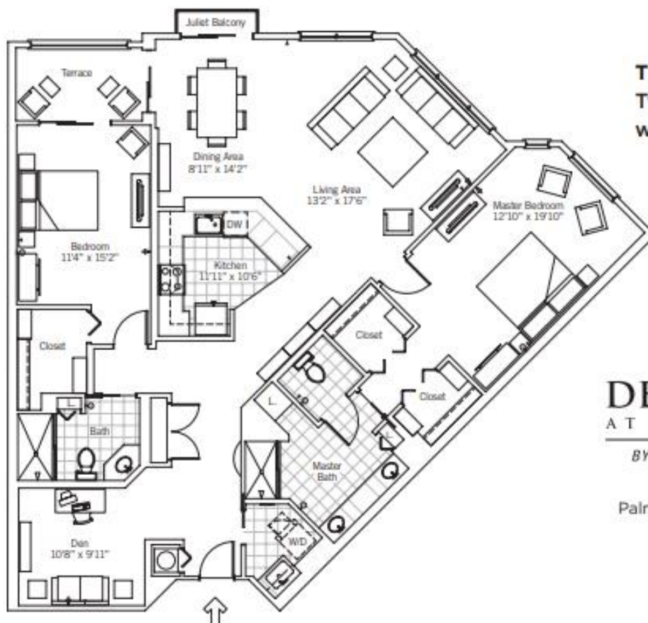
The Oxford Two bedroom, two bath with den and terrace

Call 1-800-936-2849 for your free brochure or visit DevonshirePGA.com .